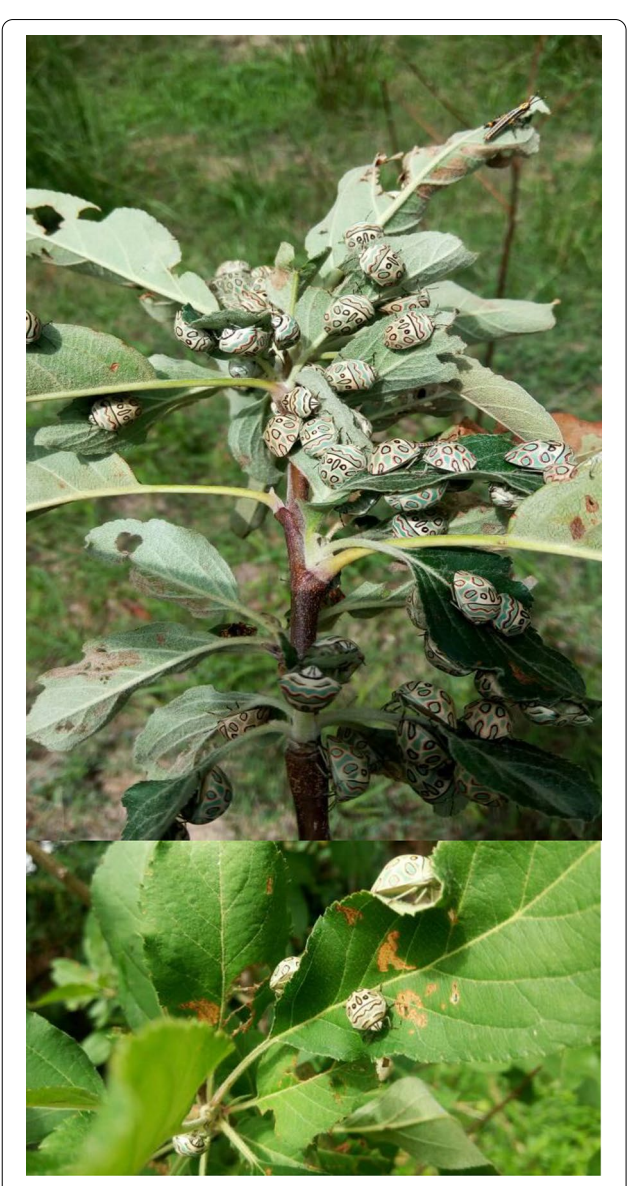
Fig. 2 *An apple pest—Picasso bug ( Sphaerocoris annulus )—at an orchard (with 200 stands of apple trees) in Kinat, near Mangu, Plateau State. *NB—Although the Picasso bug is the prominent pest in the plate, it is not responsible for the chewed portions of the apple leaves. This is because the Picasso bug has a piercing and sucking mouth part which focuses on the sap from the apple plant. Therefore, the apple plant in the plate above was attacked by multiple insect pests. The insect pest responsible for the damage on the plant has a biting and chewing mouth part and it is most likely a grasshopper ( Zonocerus variegatus ) which can be seen at the top right end of the plant in the plate

The discussants pinpointed that there was no coordinated platform for information sharing and execution of planned actions. They also berated the academic system that it was too theory oriented rather than practical based; stating that there was need for them to carry out practical oriented research on apple production. They also said that this aspect was closely tied with effective extension services.