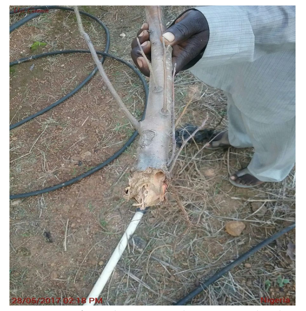
Fig. 1 Remains of an apple tree eaten up by termites in Barki Ladi