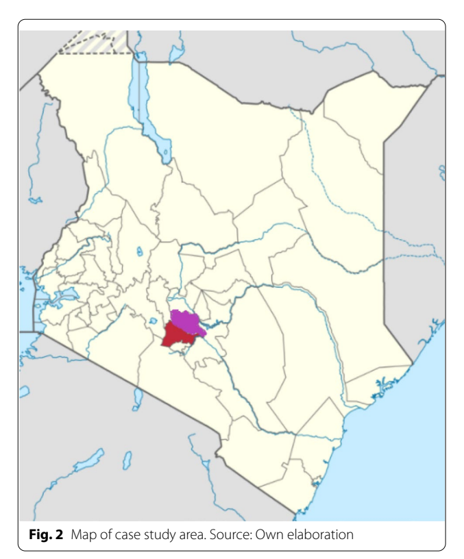
where tea, forestry and tourism are the most important activities. The lowlands have an adequate climate for dairy farming and agricultural production [27].