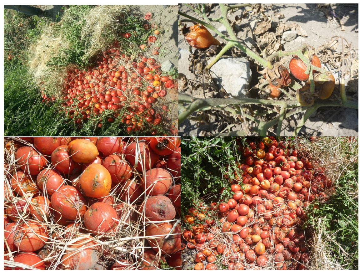
Fig. 6 Enormous tomato losses caused by Tuta absoluta in Ngabobo village