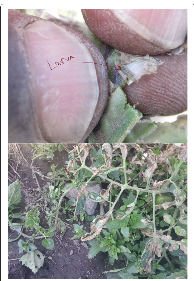
Fig. 5 Leaf damages between upper and lower epidermis of a leaf by Tuta absoluta in Ngabobo village