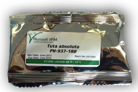
Fig. 3 Tuta absoluta specific pheromone traps (TUA optima rule) catches of adult male

tomato losses (Fig. 6) resulting in economic loss irrespective of high pesticide use. As reported in Senegal [10] and in Bulgaria [8], the plant damage symptoms, larva and adult morphological features observed under the microscope are typical of South American tomato leaf miner (Insecta; Lepidoptera: Gelechiidae; Tuta absoluta , Meyrick 1917).