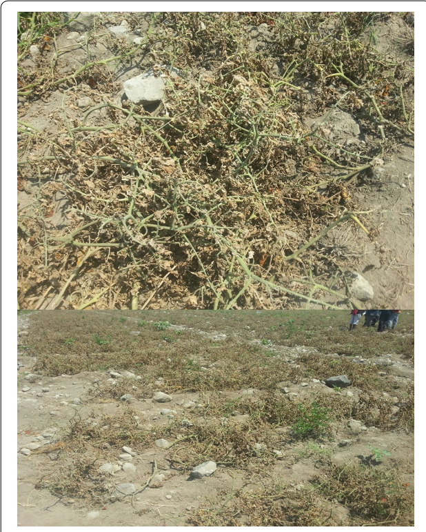
Fig. 4 Severely damaged tomato fields by Tuta absoluta