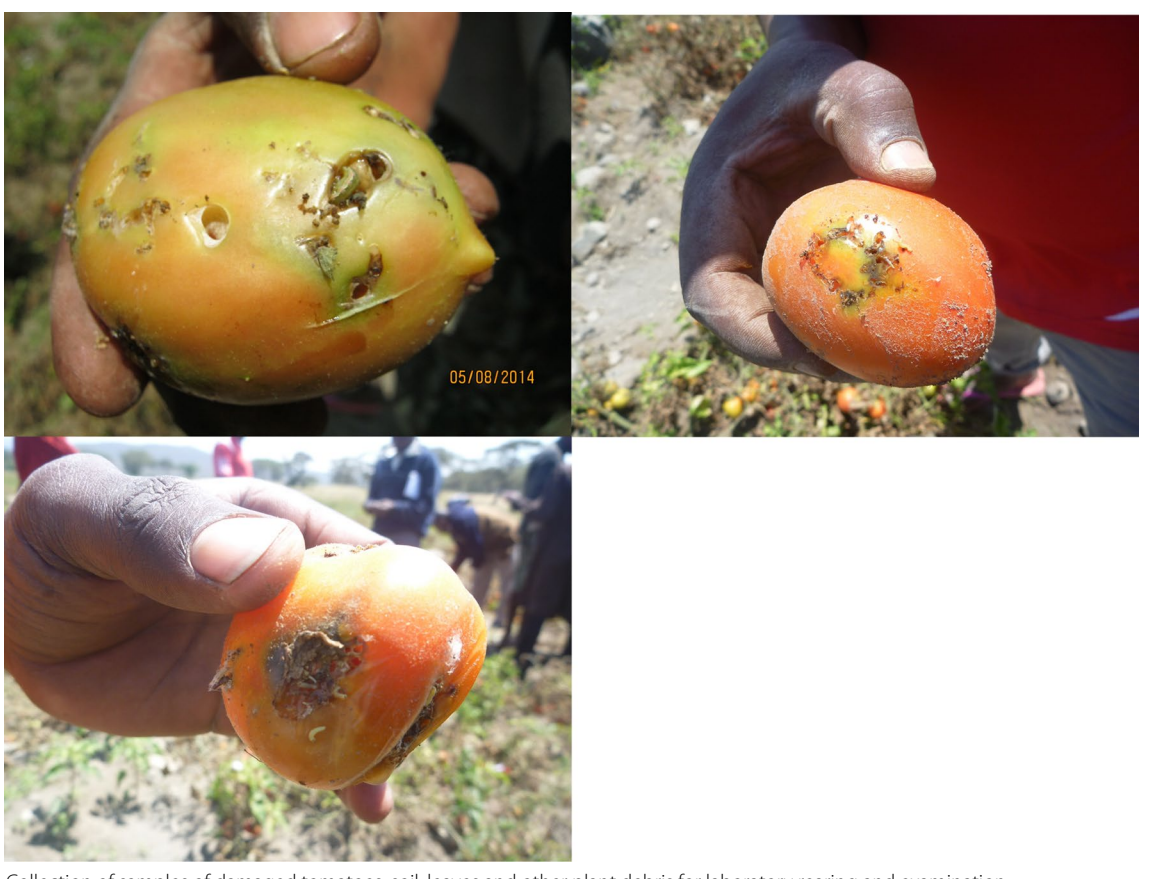
Fig. 2 Collection of samples of damaged tomatoes, soil, leaves and other plant debris for laboratory rearing and examination

In the survey, it was observed that the mean plant damage inflicted by the pest in all tomato fields was scored to be between 90 and 100 % (Fig. 4). This is the highest loss for tomato growers who have ever experienced (village extension officer verbal communication). The larva mines the leaves (Figs. 5, 6) producing large galleries and later burrows into fruits. The pest did not concern till June 2014 when growers started suffering enormous